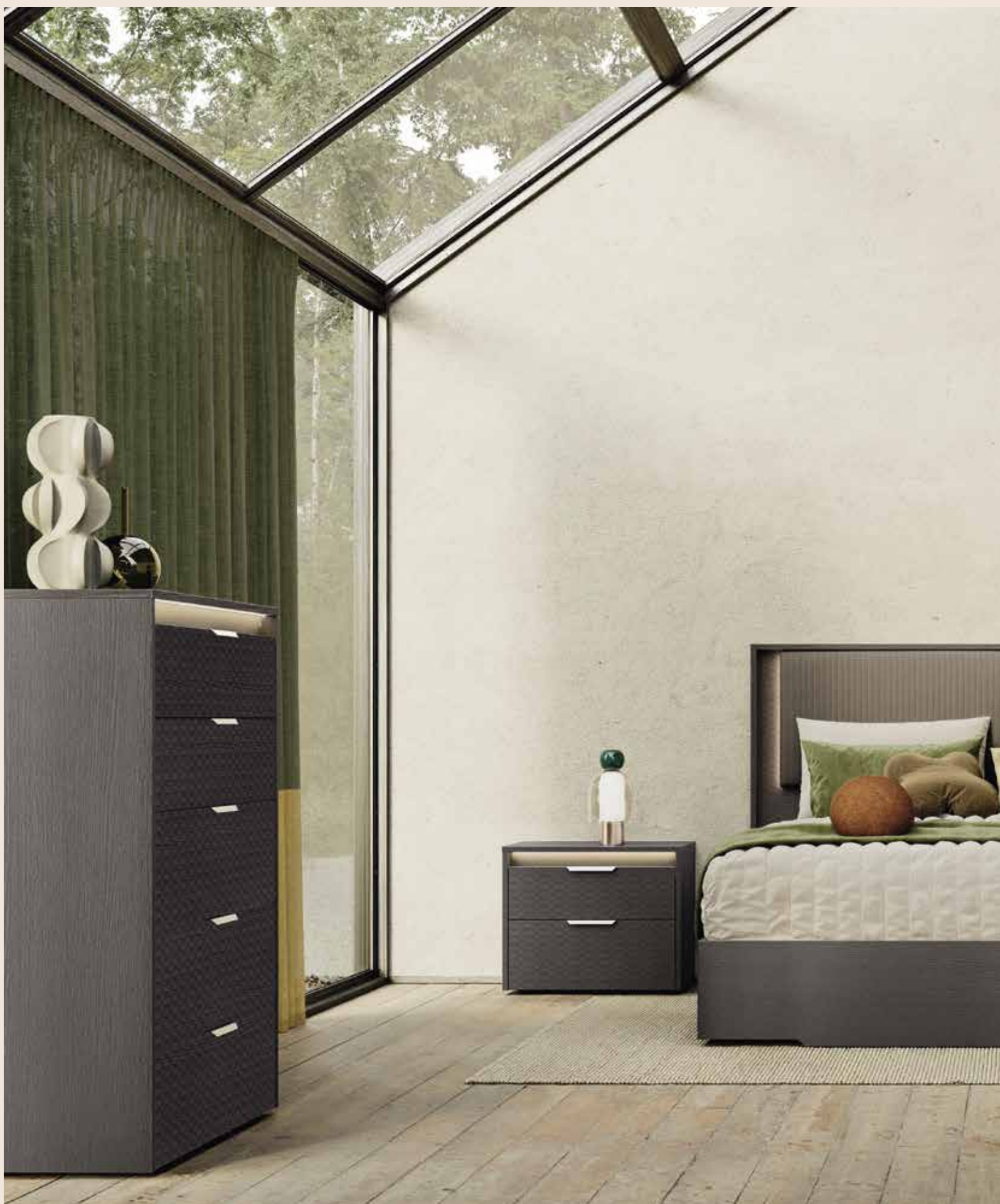
Amy bedroom set, Alpine interior in the Dolomites