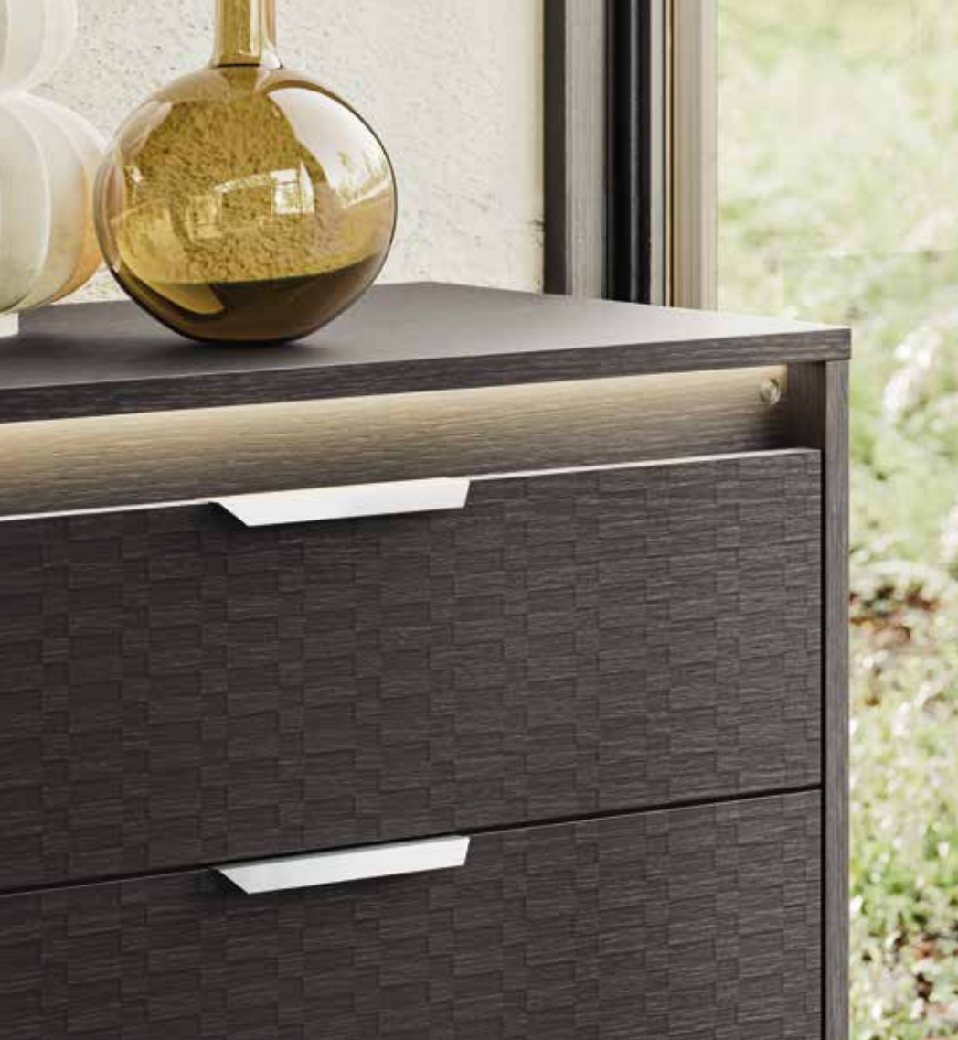
Amy bedroom set, Alpine interior in the Dolomites

The Amy dresser with six drawers and soft lighting, and the chest with five drawers, both feature a Tetris-textured finish on the drawer fronts, blending functionality with modern elegance.