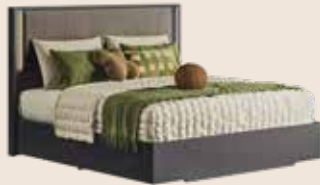
Q.S./UK 5" BED PJAY0150