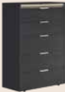
5/DRW. CHEST KJAY117